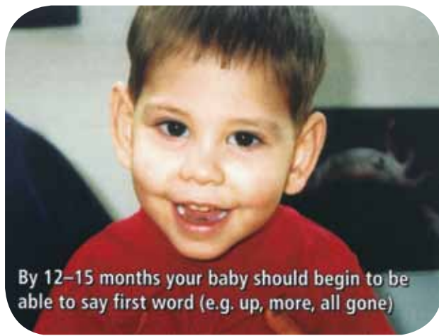
By 12–15 months your baby should begin to be able to say first word (e.g. up, more, all gone)