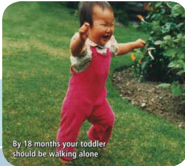
By 18 months your toddler should be walking alone

Ask your doctor if your child mostly walks on her toes, or if your child was walking well but now seems weaker or more clumsy.