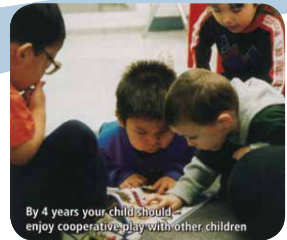
By 4 years your child should enjoy cooperative play with other children