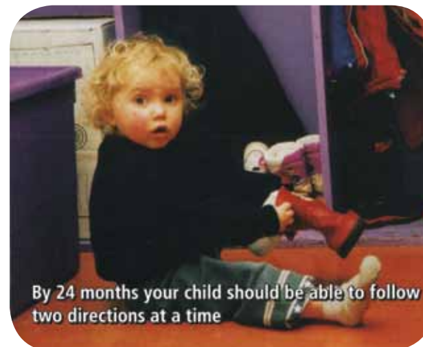
By 24 months your child should be able to follow two directions at a time