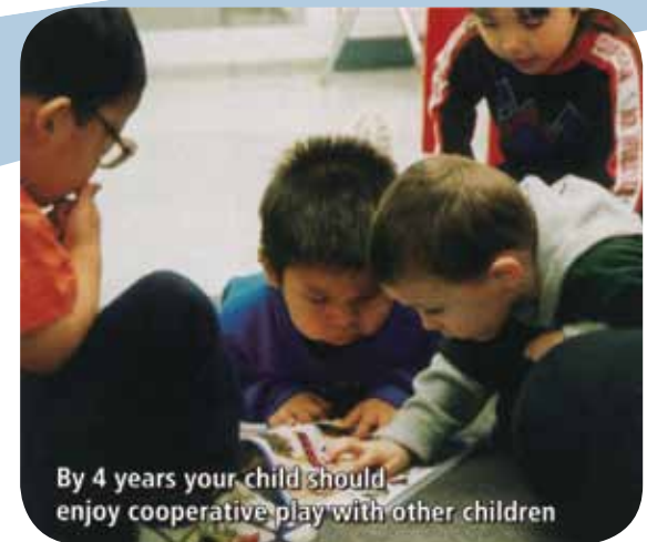
By 4 years your child should enjoy cooperative play with other children